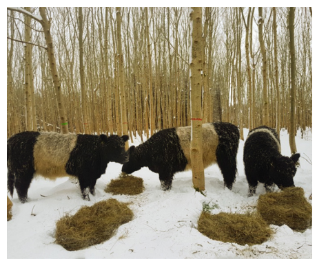
Figure 5: Belted Galloway cattle in Jane Shackleton's agroforestry-based beef system in Mullagh, Co. Cavan. Note the trees selected for felling for high quality form and timber (marked in red, left image). The cattle also overwinter within the same management system (right image).