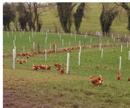
Figure 4: Calves grazing in Gavin Lynch's four-acre silvopasture hazelnut orchard, in Wicklow (left). Developing agroforestry within a poultry unit in McAdoo, Co. Monaghan (right).

the principle of multiple outputs within goals of sustainability and carbon neutrality to be pursued in a wide range of farming scenarios. It will also ensure that silvopasture can be used to extend the grazing season to help higher grass utilisation, reduce the period when animals must be housed and hence reduce ammonia emissions and give resilience to grazing during extreme rainfall as the improved soil percolation will minimise potential damage to tree roots or soil structure.