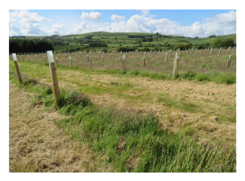
Figure 3: Agroforestry being established for a rotational outdoor livestock rearing system at Allshires, Roscarberry, Co. Cork.

The main criticism with this scheme has been the lack of flexibility in planting and protection specifications and the reclassification of land planted in agroforestry as afforested. Support, including education and training, should be provided for the controlled introduction of agriculture into existing established forests to manage vegetation as a form of silvicultural tool. For example, planting trees in groups or permitting grazing in respaced or thinned forests can provide shelter for the animals while at the same time suppressing potential fuel banks for wildfires.