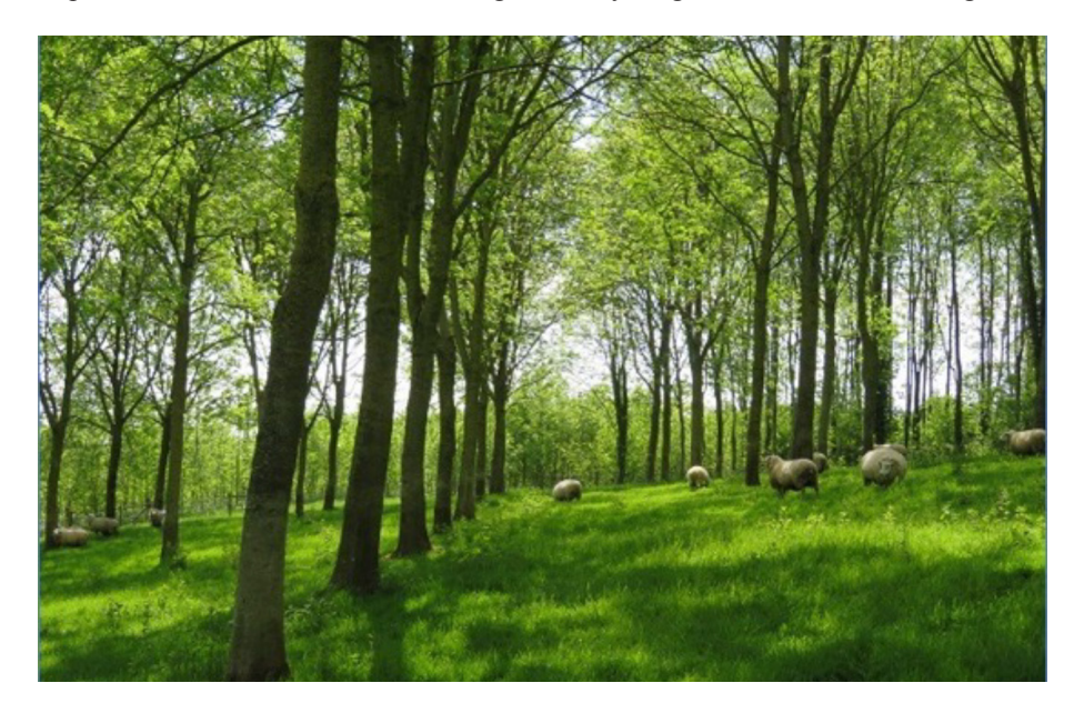
Figure 1: Twenty six-year-old silvopasture at AFBI Loughgall, Co. Armagh.

Agroforestry has been shown worldwide to have huge (overall) potential including mitigating emissions, enhancing biodiversity, improving animal welfare, delivering improved soil function and enhancing water cycling associated with having trees