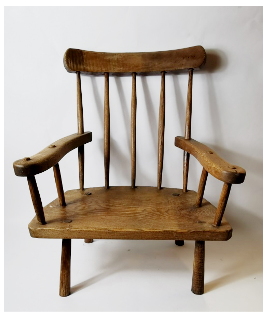
Figure 3: A 19<sup>th</sup> century Monaghan ash hedge chair, recently featured at an auction of Irish country furniture in 2020 at Victor Mee Auctions in Cloverhill Belturbet (Available at https://www.victormeeauctions.ie/irish-country-furniture-vernacular-furinture/) (images are copyright of the National Museum of Ireland).

Scottish settlers in the seventeenth or eighteenth century. Ash was widely used for other types of furniture as its wood can be steam bent into various shapes, a quality that made it useful in boat building also (Nelson and Walsh 1993). Another famous vernacular use for the strong and elastic properties of ash timber is of course for making hurleys. In ancient Ireland ash was used for spears and bowls, and yokes for livestock (Kelly 2000).