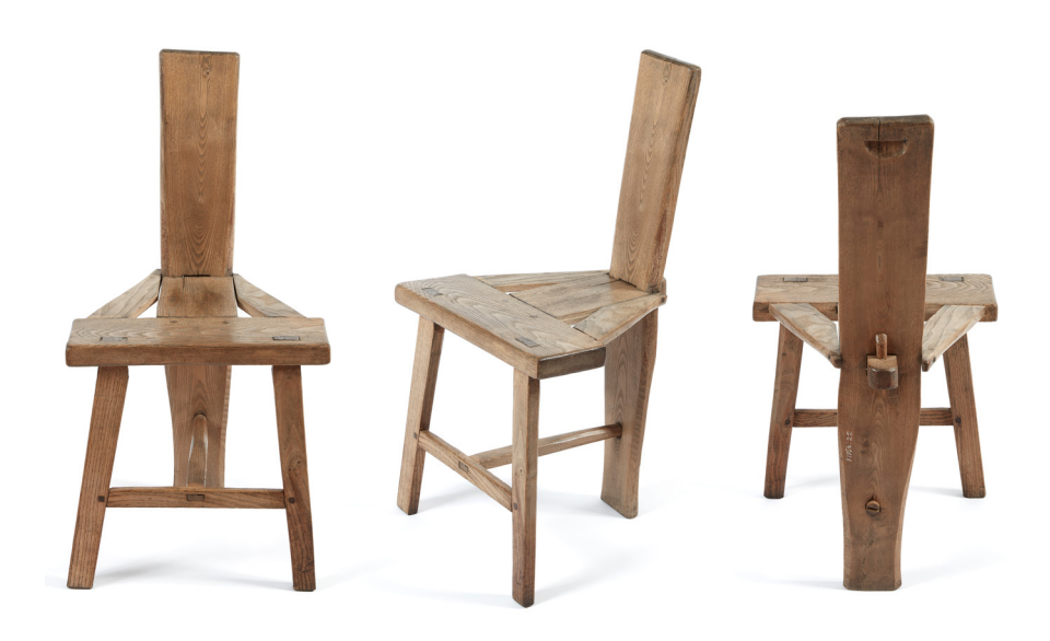
Figure 4: An interesting example of a three-legged Irish "Tuam chair", was collected by The Folklore Society of Ireland and is from the Tuam region of Co. Galway. The third image shows the tenon wedge construction. Images reproduced with kind permission, The Irish Folklore Society.

Both beech ( Fagus sylvatica L.) and sycamore ( Acer pseudoplatanus L.) had many uses, even though neither are native trees (Evans 1957). Sycamore probably came to Ireland with seventeenth century planters, while the beech most likely arrived in medieval times. Both were favoured for dry-coopering, in others words, for the provision of casks and butter firkins<sup>3</sup>. Beech was also particularly valued as it can be steam-treated to bend, and so was used for the keels of boats, and for furniture (Nelson and Walsh 1993). Sycamore with its white easily worked wood was also a favourite for making wooden dishes, ladles, and skimmers, which were turned on a pole-lathe (Evans 1949). Like beech, the wood of sycamore can be steam treated, and it was moulded to make the bodies of violins and harps. The harp of the famous blind harpist Turlough O'Carolan was made entirely of sycamore (Nelson and Walsh 1993).