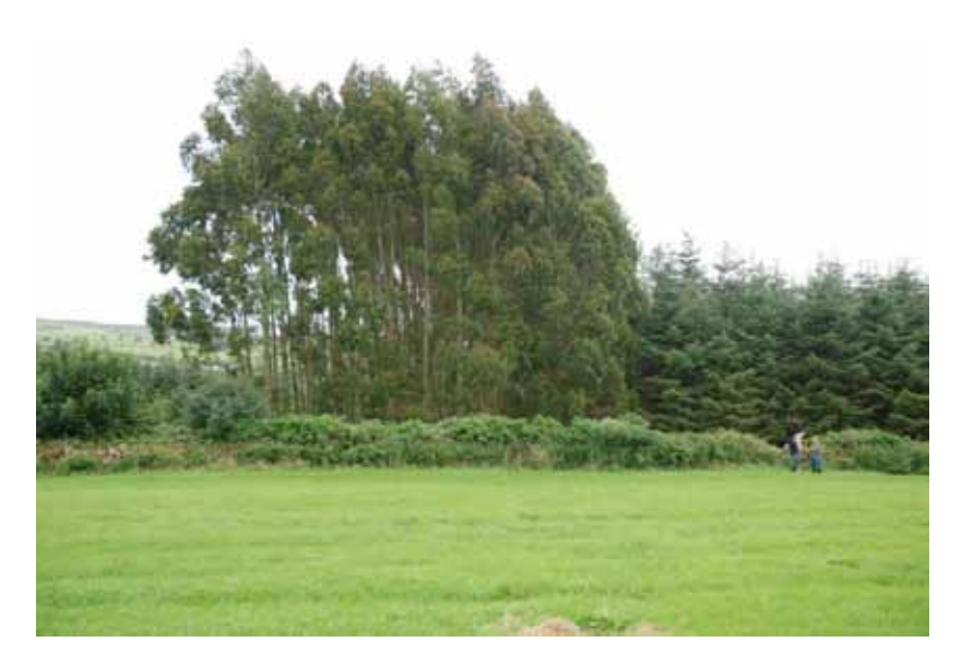
Figure 1: An 18-year-old stand of Eucalyptus nitens next to one of Sitka spruce, a year older, at Cappoquin, Co. Waterford.

The establishment results described in this paper come from a series of operational trials testing a range of species on a series of different reforestation sites in the Coillte estate, established between 2008 and 2011. All trials were planted with 25 to 30 cm containerised plants, established at 2 by 2 m spacing. The objective was to keep establishment costs (including plant costs) as low as possible, while carrying out all necessary operations for the successful establishment of the crop.