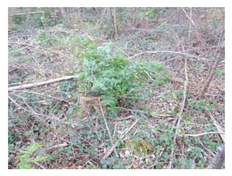
Figure 7: Coppicing from a harvested E. nitens stump.