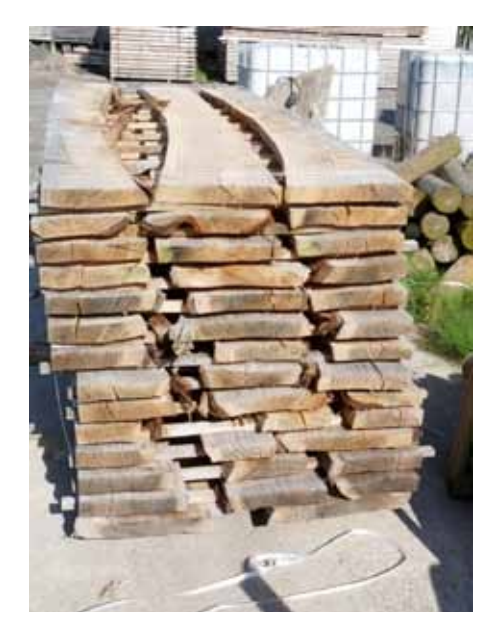
Figure 8: E. nitens rough-sawn planks at Dundrum sawmill.

timber can be overcome and that a successful business can be developed with this product (Cannon and Innes, 2008).