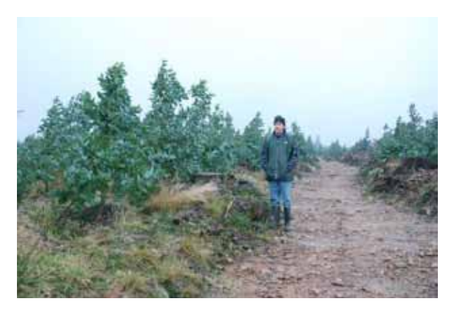
Figure 5: E. nitens plantation after 2 growing seasons at Macroney, near Kilworth Co. Cork.

Containerised plants can be planted with a dibble or spade, but it is important not to plant too deep or too shallow. If the peat plug is higher than the surrounding soil, it will lose moisture which will affect plant growth. Proper plant handling and minimum storage of plants on site before planting is necessary. Plants should not be allowed to dry out prior to planting.