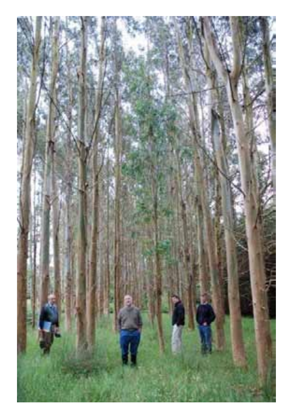
Figure 6: E. nitens stand at Cappoquin, Co. Waterford at 18 years-of-age.

CQN3- Cappoquinn stand 3 CQN7- Cappoquinn stand 7 DDM- Dundrum JFK- John F. Kennedy Arboretum GRY- Gorey (Red Bog)